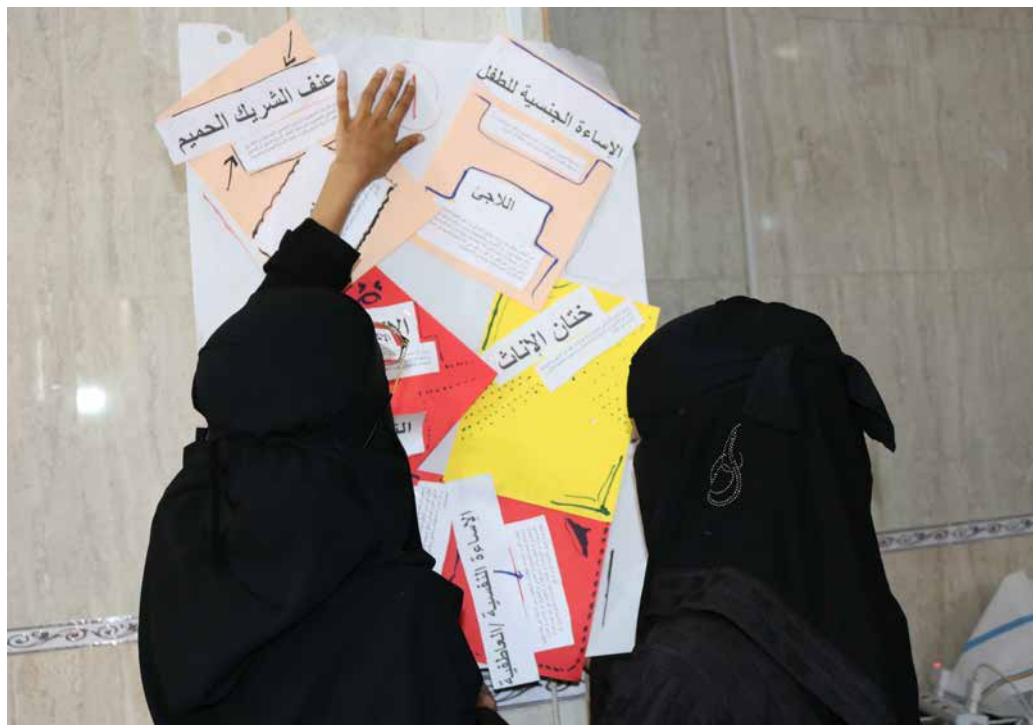
Gender-based violence training for journalists (September 2019), Hadhramaut Governate of Yemen.